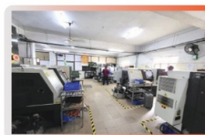
CNC Turning Machines