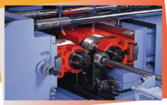
Thread Rolling Machine