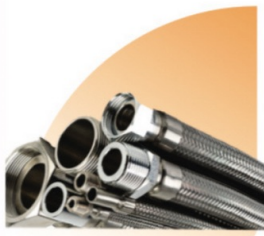
PTFE Hose Pipes