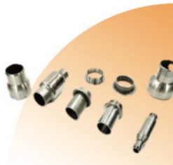
Pipe Forming Components