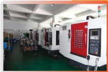
CNC Milling Machine