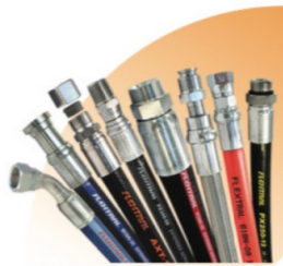
Hydraulic Hose Assemblies