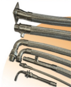
SS Corrugated hoses