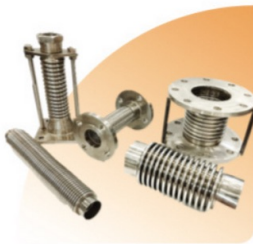
SS- Expansion Joint Bellows